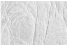
20 mm x 30 mm